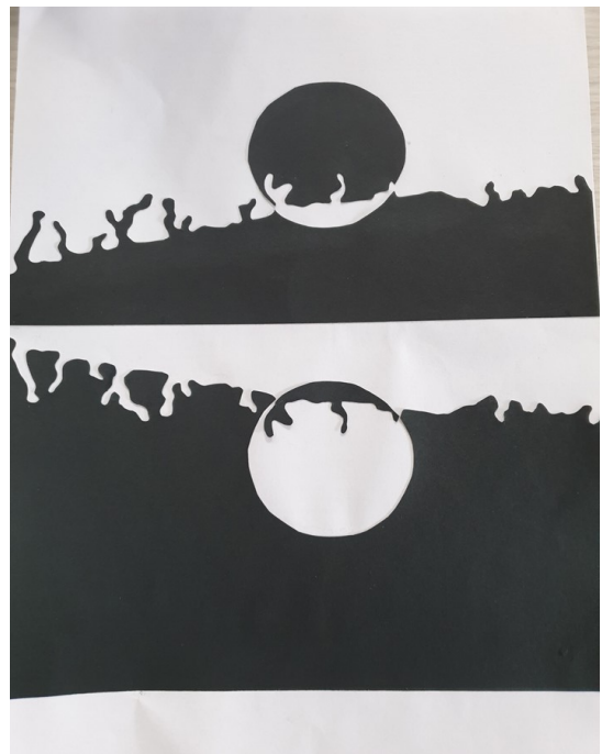
By Erica Little 5/6G