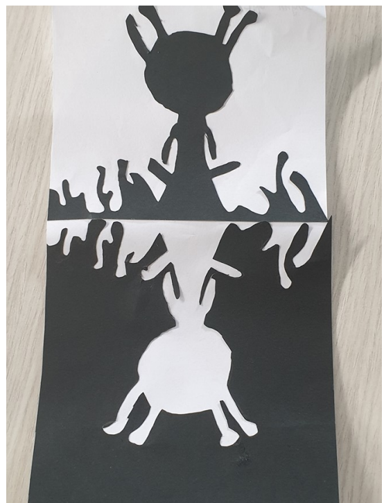
By Quynn Sokolowski 3/4E