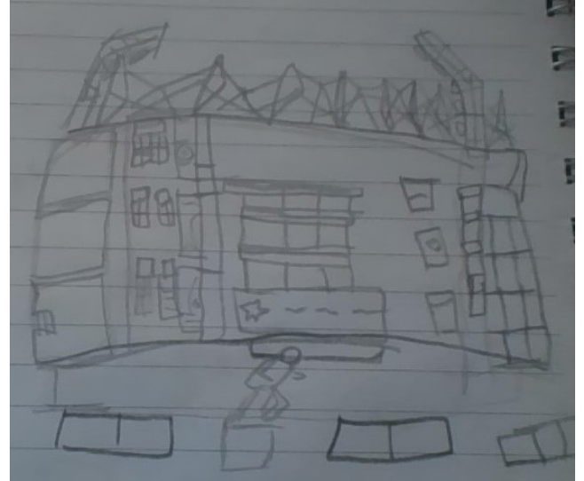
Sketch by Ashton Lyddy